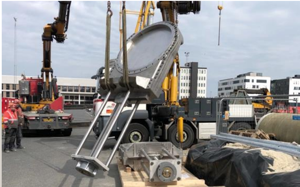
Delivery of one of the DN 1200 Wey knife gate valves without actuator