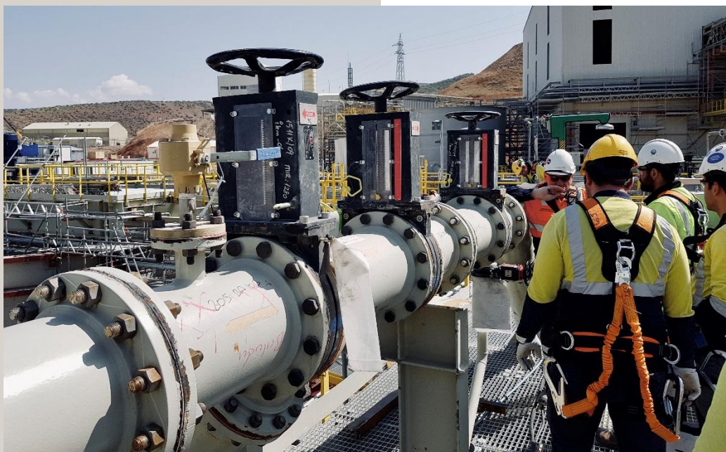
Sistag team on site at the Çöpler mine